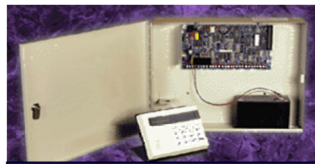
Battery shown in a control panel

Alarm systems are designed to aid in the protection of your personal property. Although alarm systems are a security tool, they are vulnerable to attack. What measures are employed by the alarm company to protect your security system? Most alarm systems are dependent on the phone line for their ability to make notification to the alarm company and the police. What if the phone line was inoperable or sabotaged? Does your alarm system still have the capability to make a notification? Three back-up systems are available for phone lines: cellular phones, radios and dedicated phone lines. More important than the phone line is the alarm system's power source. All alarm systems require electrical power. What if power was suddenly interrupted? The winter storms of February 2002 and October 1996 resulted in power outages for days. This is a prime example of how the electrical system can be interrupted for an extended period of time. Most alarm systems come with some form of alternate-battery power. Most alarm systems have battery back-up which can sustain the